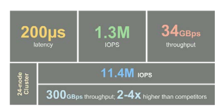
Figure 3) NetApp AFF A800 delivers exceptional performance in both NAS and SAN configurations.

The AFF A800 is world's fastest, most cloud-connected all-flash array. You can connect to more clouds, with more intelligent cloud services. Running on ONTAP software, AFF A800 allows you to move your data and applications where they run best, either on the premises or in the cloud, leveraging the same ONTAP data management. Embrace multicloud by using Amazon Web Services (AWS), Azure, Google Cloud, and other leading cloud providers for backup, disaster recovery, tiering, cloud analytics, and workload bursting for business agility. ONTAP lets you harness the power of the hybrid cloud.